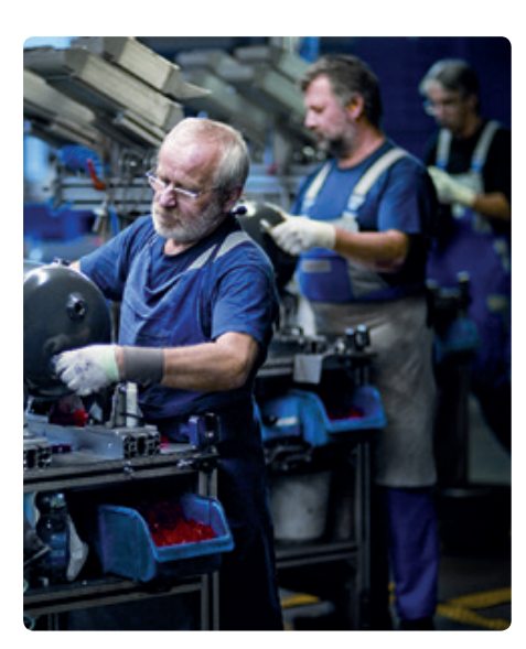
Final assembly of pressurized air containers

The previously completed introduction at two of the group's plants gave DUALIS an advantage during the selection of detailed planning software for additional Frauenthal Automotive locations, chuckles Schubert.