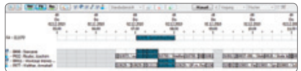
Detailed GANTT chart for a production order