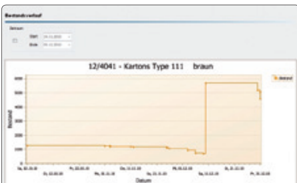
Inventory level for an individual stock item

Also Fischer is using GANTTPLAN to give clients a reliable delivery commitments. Most orders are received with a requested delivery date and GANTTPLAN processes a Dummy-Order to check if the requested delivery date is realistic or not. Now when clients are informed of their delivery date and the goods arrive as expected, the result is a much higher level of customer satisfaction.