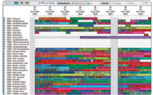
Order and Resource allocation in the Production plan

“It was not easy to get control of production, it is a very sensitive facility – any machine could be a bottleneck and it seemed every resource was the potential weak link”, informed Frank Gross, production manager at K. Fischer. “We needed a planning system to link customer orders with our inventory and materials management. The tool should connect to our Excel spreadsheet and extract the necessary information for material stock and customer orders and based on this create an order sequence with optimal resource allocation.”