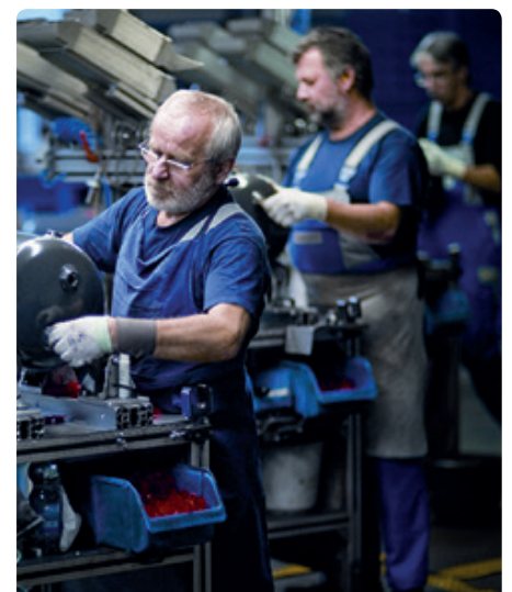
Final assembly of pressurized air containers

The previously completed introduction at two of the group's plants gave DUALIS an advantage during the selection of detailed planning software for additional Frauenthal Automotive locations, chuckles Schubert.