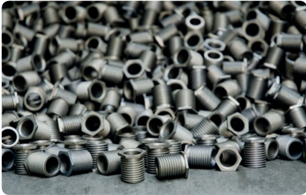
Galvanic surface coating of mass-produced parts

Planning is at the heart of manufacturing. So states Galfa, with more than 5000 surface coating orders per month to process and schedule at 40 processing areas spread over three separate sites. The planning is completed by DUALIS's short term planning and production optimization tool GANTTPLAN. Galfa's GANTTPLAN solution enables centralized planning for their three production areas, and is helping the company develop their vision for an Industry 4.0 smart factory. Improved throughput times, better planning accuracy, and more on-time deliveries are just three of the benefits from the GANTTPLAN implementation.